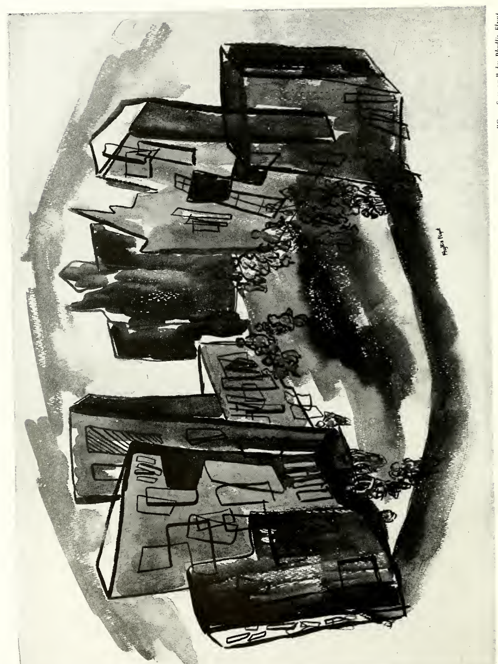
"CITY SQUARE," by Phyllis Flynt